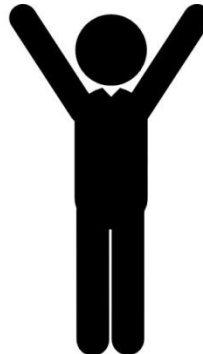
Family Of Origin